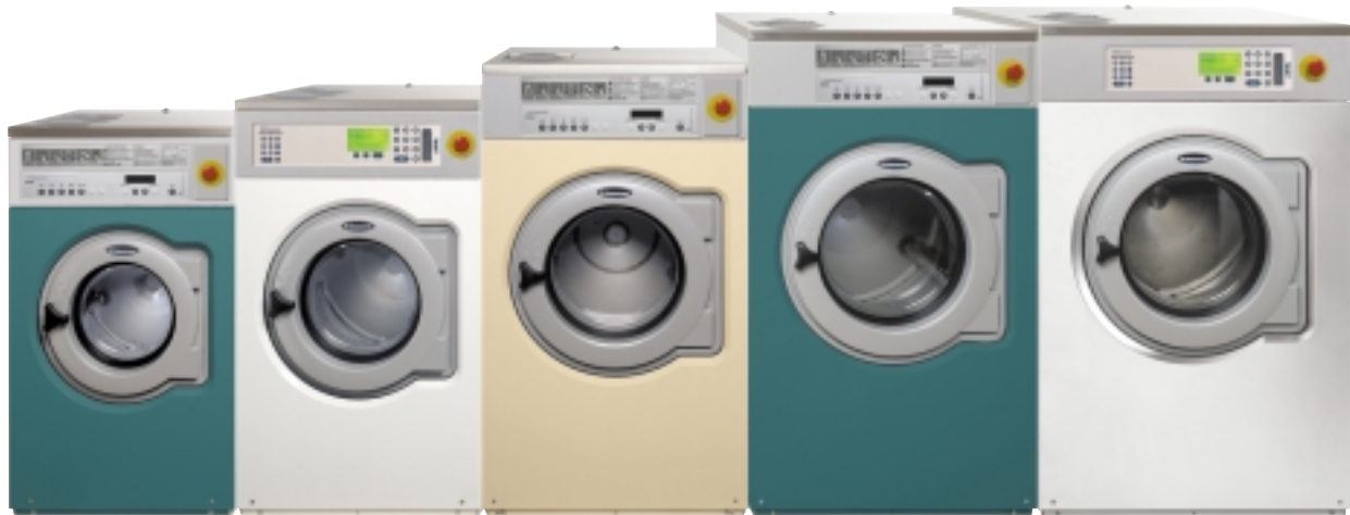
SU620s / 20 lb. cap. SU630c / 30 lb. cap. SU640s / 40 lb. cap. SU655s / 55 lb. cap. SU675c / 75 lb. cap.

Wascomat commercial, solid-mount, high-extract "Super" washer models save water, energy and labor, cut drying time for big gas savings and increase laundry productivity. Ideal for any in-house and commercial laundry installations.