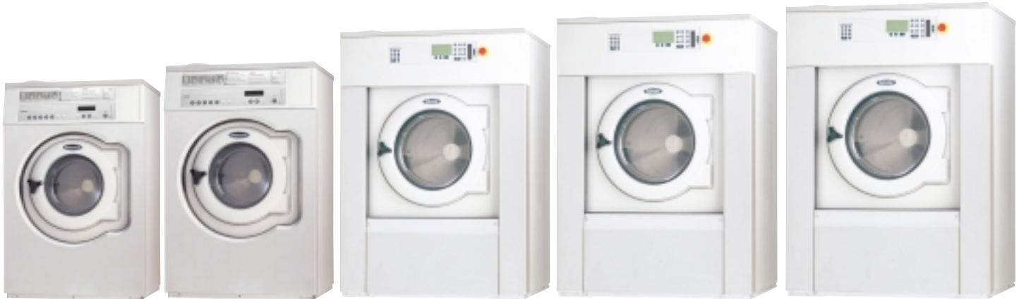
EX618s: 18 lb. Capacity. Up to 350 G-force.

Designed and built for the 21st Century!